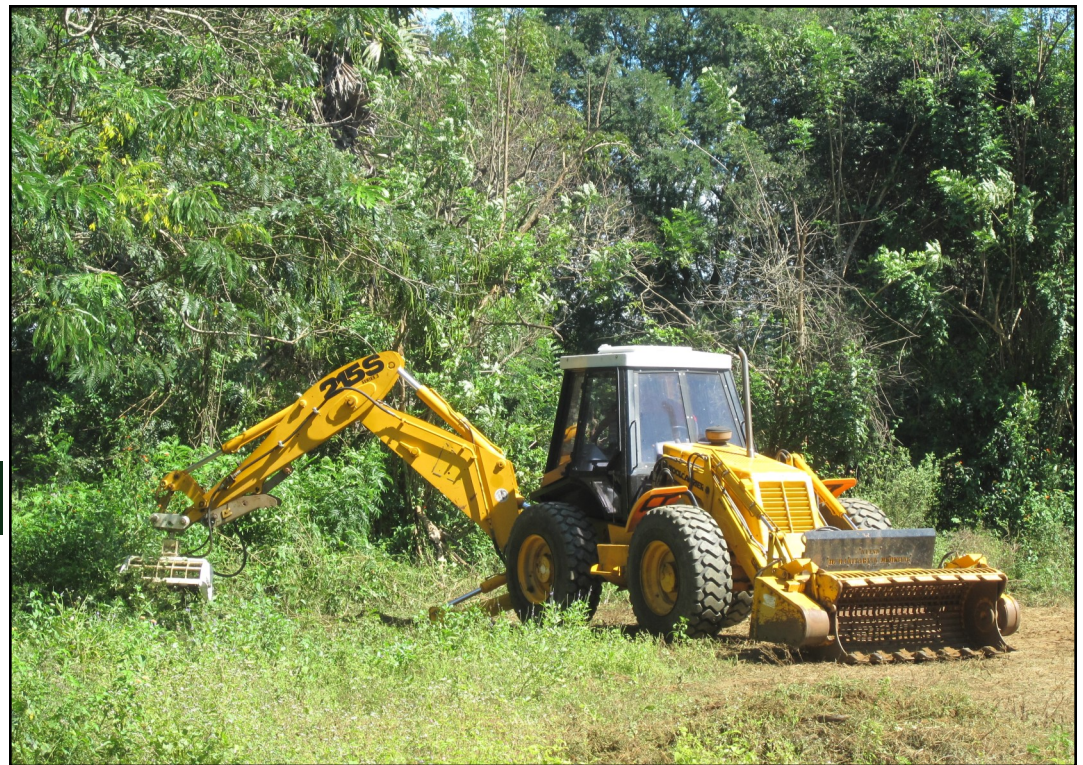
IBH cutting vegetation with back boom

The Improved Backhoe (IBH) provides a mobile system that opens up areas for demining teams by clearing vegetation and sifting mine suspected soil. The IBH is a modified JCB 215s platform. It is armored and fitted with SETCO solid rubber tires to minimize flats caused by blast fragments and debris. A toolbox of attachments has been added to the system to increase functionality, such as a Rotar sifting bucket which is capable of digging and sifting loose soil for AP mines, and a medium-sized vegetation cutting attachment which attaches to