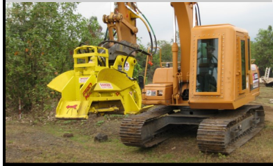
Promac cutter in Cambodia