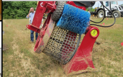
Conical wet soil sifting Bucket