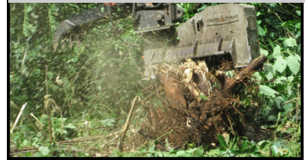
Denis-Cimaf Cutter in Guadalcanal