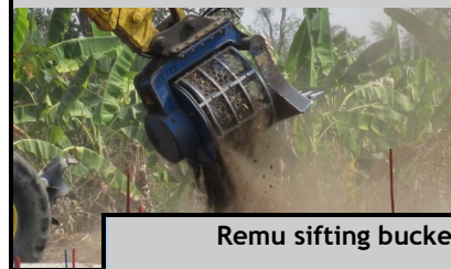
Riddle sifter in Cambodia