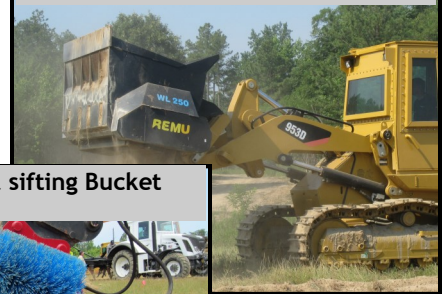
Conical wet soil sifting Bucket