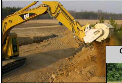
Rotar sifting bucket