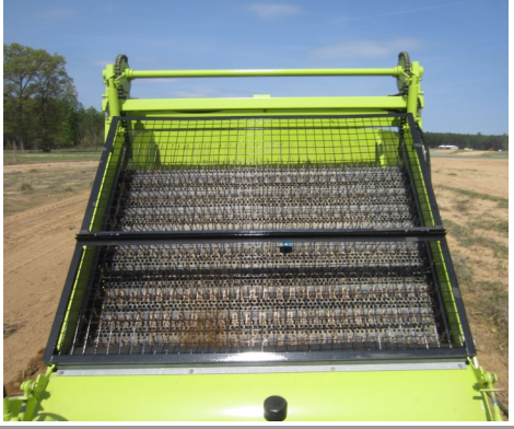
Left: Illustration of sifting mechanism. Right: Mine simulant being lifted by the Turf Rake during technical evaluation